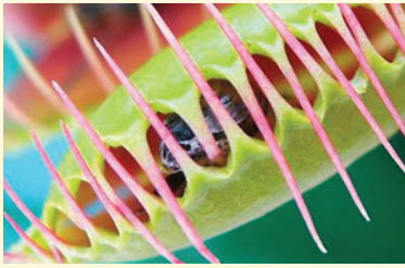
Venus Fly Trap